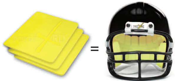
PORON® XRD™ Protection - A game changing material for a variety of applications