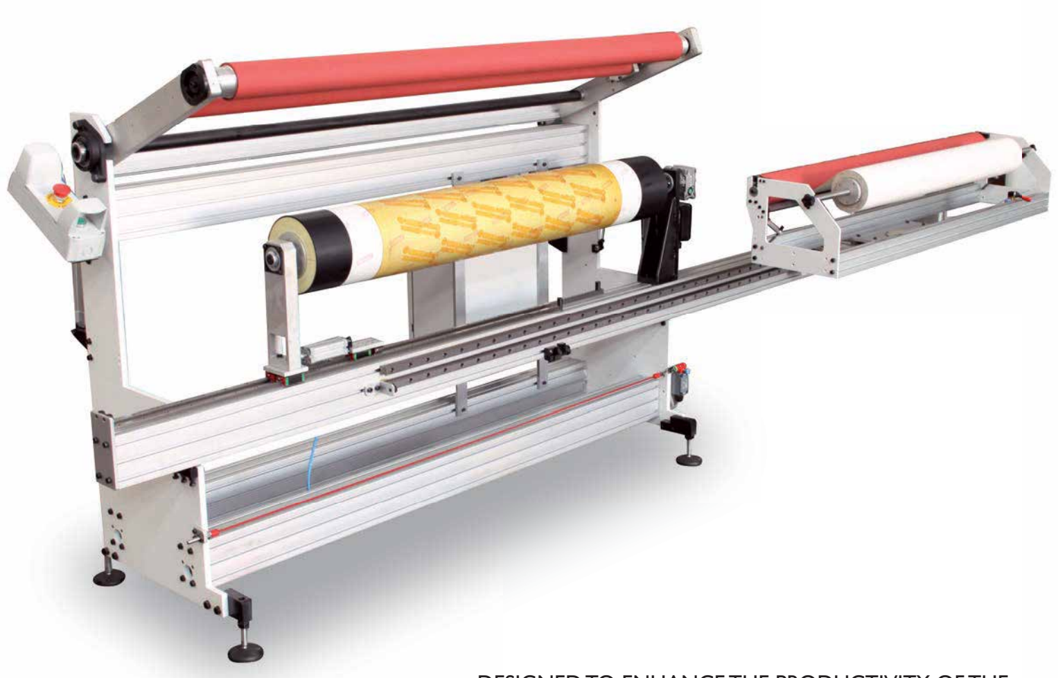
PLATE DEMOUNTING AND TAPE APPLICATION

DESIGNED TO ENHANCE THE PRODUCTIVITY OF THE FLEXO PRE-PRESS DEPARTMENT WITH THE SAME SIMPLICITY AND REPEATABILITY OF OUR PLATE MOUNTING SYSTEMS