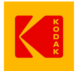
Plate Mounting Tapes

Our Himark USA and Lohmann GmbH ranges are designed for firm hold of all photopolymer printing plates in multiple applications.