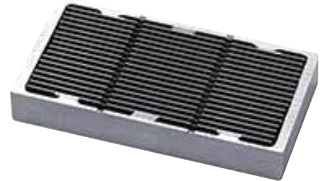
Plate Racking and Storage

Easily upgrade your equipment to make mounting and registration simple, fast and clean.