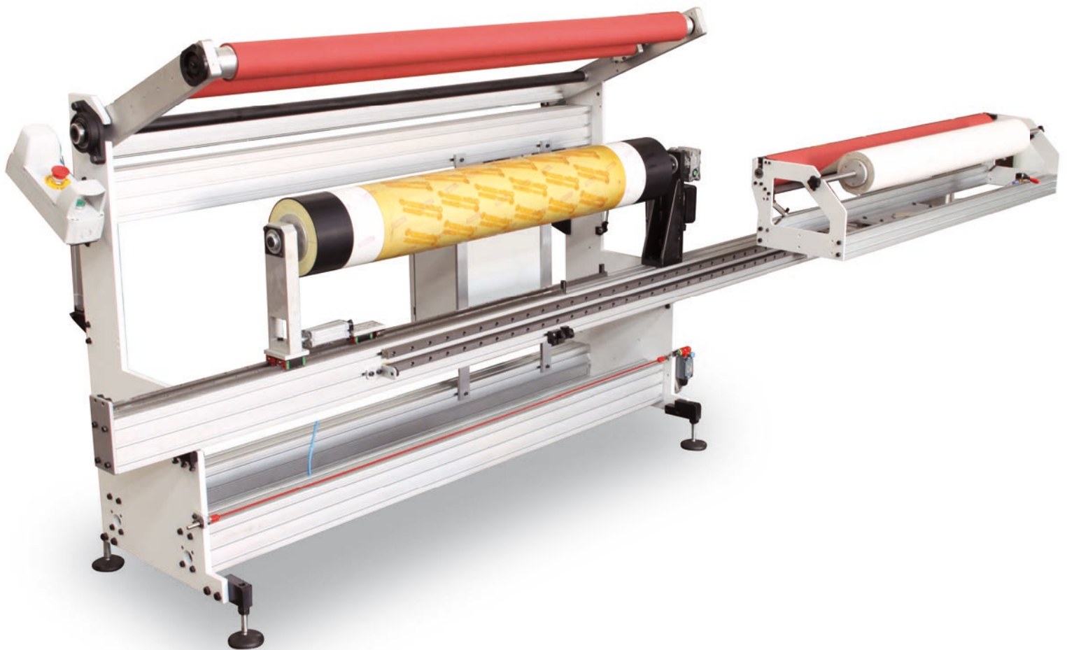
PLATE DEMOUNTING AND TAPE APPLICATION

DESIGNED TO ENHANCE THE PRODUCTIVITY OF THE FLEXO PRE-PRESS DEPARTMENT WITH THE SAME SIMPLICITY AND REPEATABILITY OF OUR PLATE MOUNTING SYSTEMS